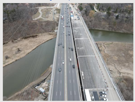
APRIL: Credit River Twin Bridge.