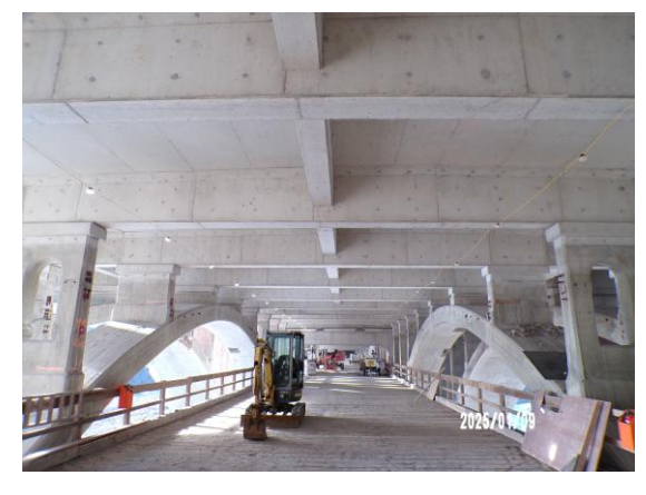
JANUARY: Existing Credit River Bridge – East-West Pedestrian-Cyclist Crossing Construction.