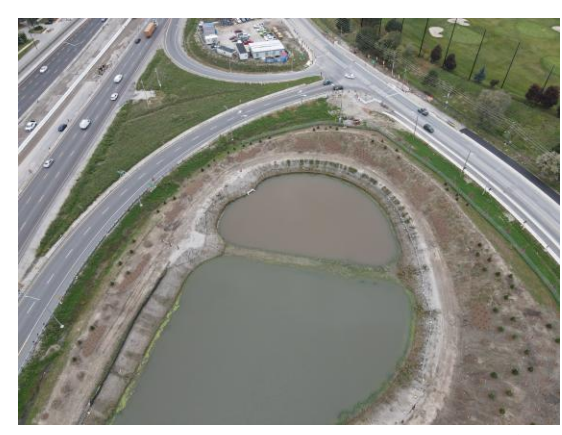
OCTOBER: Landscaping at Mississauga Road (Wet Pond).