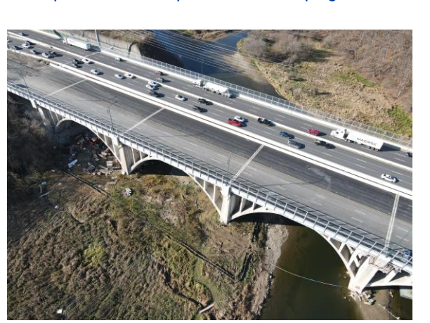
NOVEMBER: Existing Credit River Bridge – Road Surfacing and Rehabilitation completed.