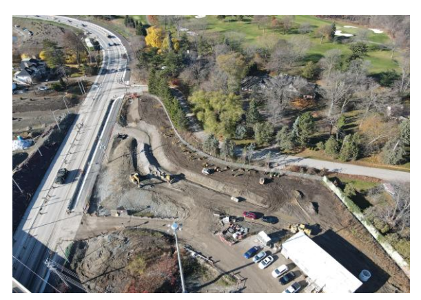
SEPTEMBER: Mississauga Road North of QEW Overpass - Multi-use path and landscaping.