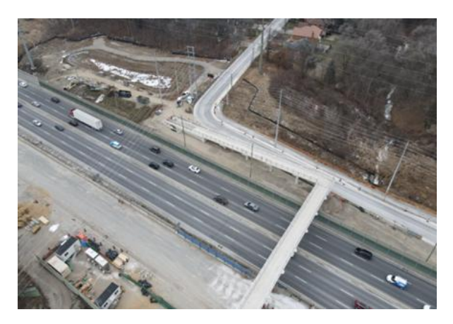
DECEMBER: North-South Pedestrian-Cyclist Crossing – North ramp and middle span completed.