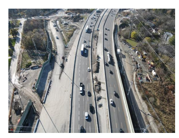
NOVEMBER: Mississauga Road eastbound on ramp construction.