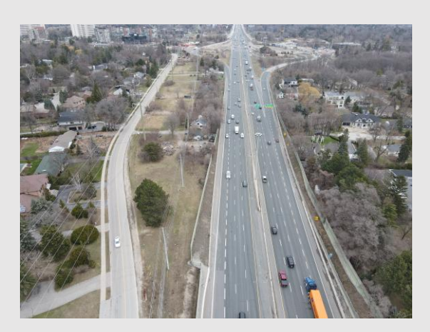
APRIL: QEW mainline east of Mississauga Overpass.