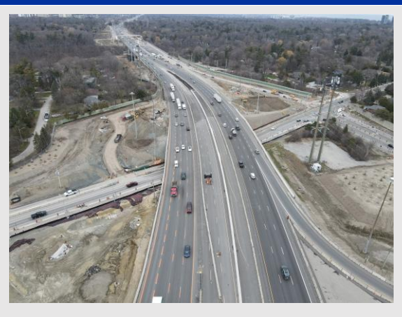
APRIL: Mississauga Road Overpass.