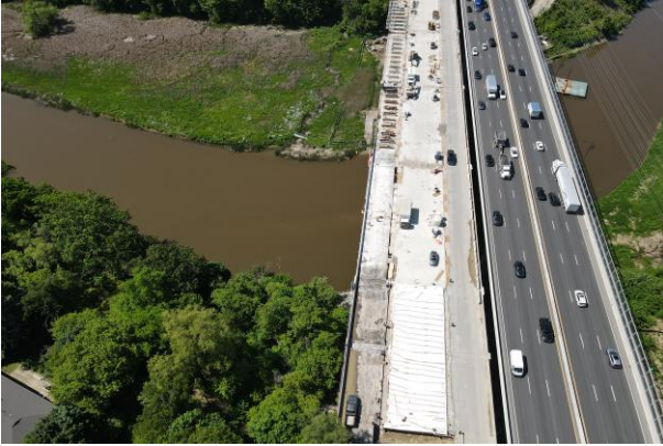
JUNE: Existing Credit River Bridge – Centre deck portion completed.