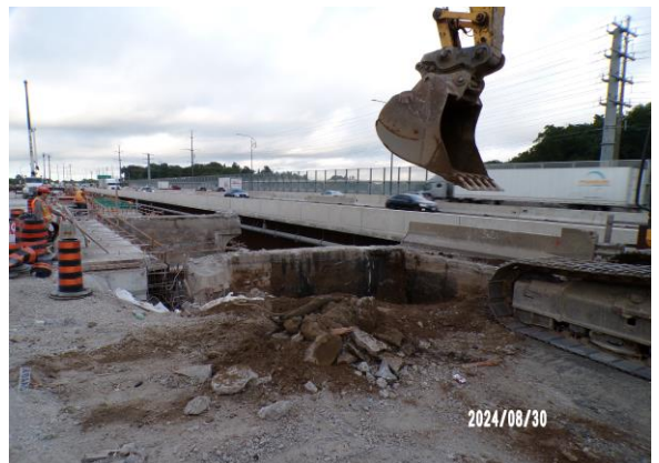
AUGUST: Existing Credit River Bridge – Demolition of the South deck completed and on-going North deck demolition.