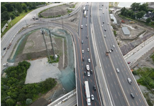
AUGUST: Mississauga Road overpass active & QEW median improvement works underway.