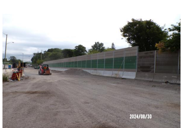
AUGUST: Existing Credit River Bridge – Noise wall installed at Kenollie Creek and on-going future eastbound lane construction.