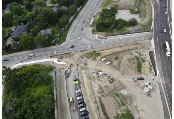
AUGUST: Mississauga Road eastbound on ramp construction.