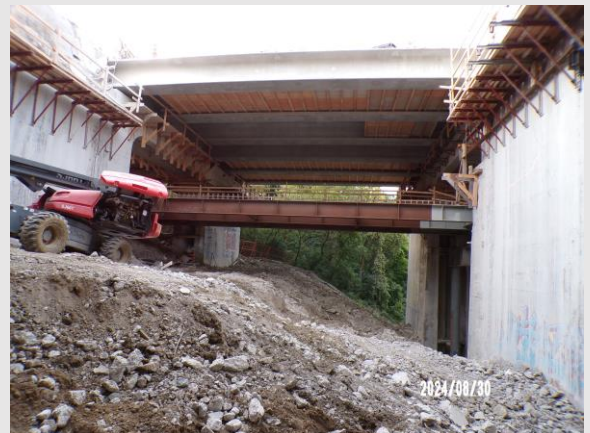
AUGUST: Existing Credit River Bridge – Deck & East-West Pedestrian-Cyclist Crossing Construction.

Crews will continue working on both the North-South and East-West Pedestrian-Cyclist Crossing this year.