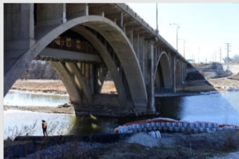
Credit River Bridge Looking West

The project is in the initial-construction phase. To date, isolated construction areas within the Credit River have been established and the construction areas are being delineated.