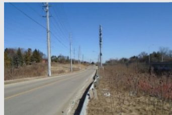
Premium Way Looking East