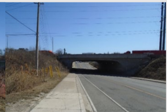
Mississauga Road Looking South