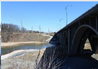
Credit River Bridge Looking East